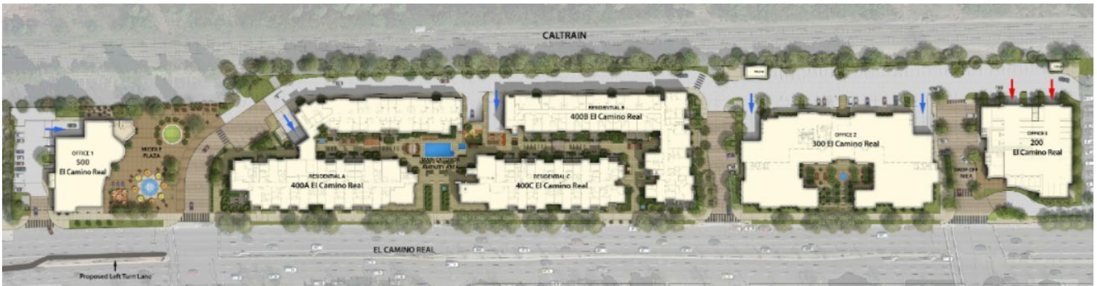
Middle Plaza Site Plan