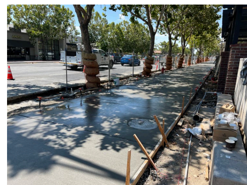
Sidewalk Pour Along El Camino Real

Faculty Staff Housing - Leasing Information leasemiddleplaza@stanford.edu