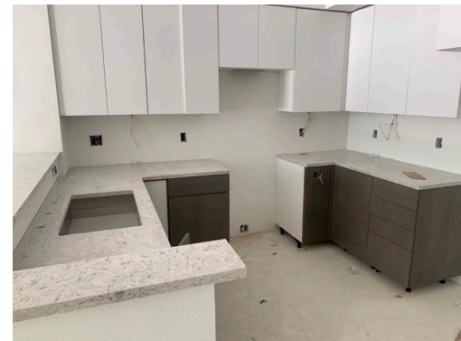
Building A Cabinet and Countertop Installations

Thanks for your patience during construction