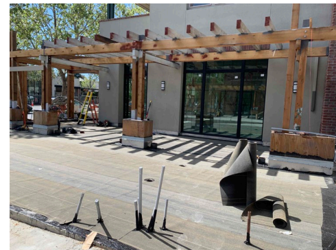
Trellis Installation around Building C Community Room

Thanks for your patience during construction