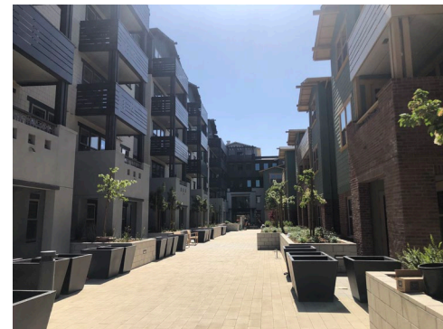
Courtyard Planters Nearing Completion

Thanks for your patience during construction