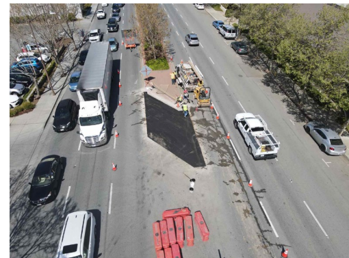
Median Work on ECR in Progress

Thanks for your patience during construction