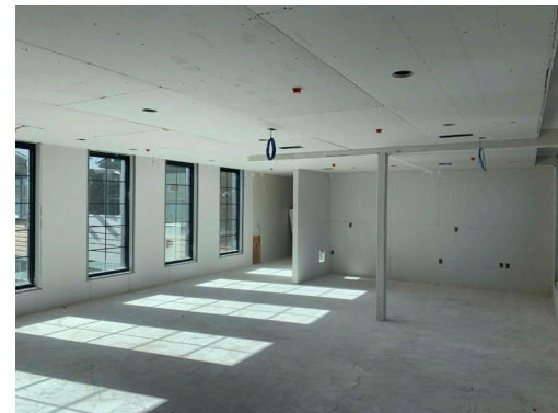
Building A Co-Working Space in Progress

Thanks for your patience during construction